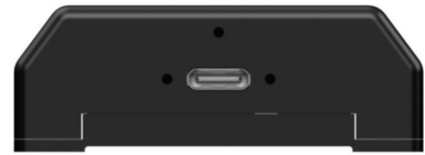
[Local Unit] Front