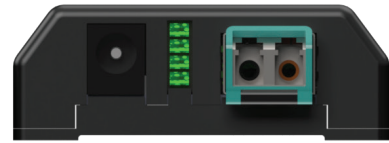
[Local Unit] Back