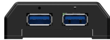
[Remote Unit] Front