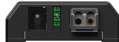
[Remote Unit] Back